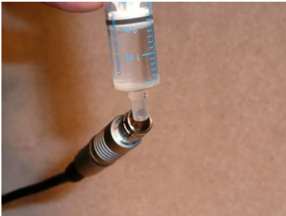
Drying Female Fischer Socket